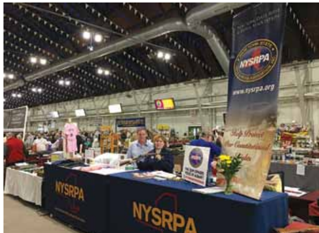
Henry Boy Silver Rifle for raffle at Syracuse Gun Show - donated by Guns Inc., Albany. Tickets will also be available at Annual Meeting of Members in Port Jervis

We are now taking a New York City case to the U.S. Supreme Court that will have other ramifications for our state and the whole country. It is scheduled to be heard sometime in October—it is the first gun case that the U.S. Supreme Court has agreed to hear in 10 years. This is a vital case and we feel we have a strong chance of winning. By the way, the NRA also is involved in this case. At gun shows, many people have mentioned their disillusionment with the NRA because they think that the association has abandoned New York. This is definitely not true. The NRA has been contributing more than anyone on this case. We definitely need its help and it still needs your support as do we.