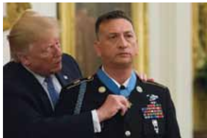
With President Donald J. Trump